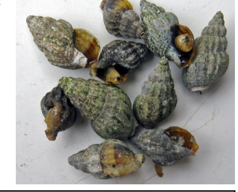
Hima fratercula found at Marine Park in Bellingham, WA